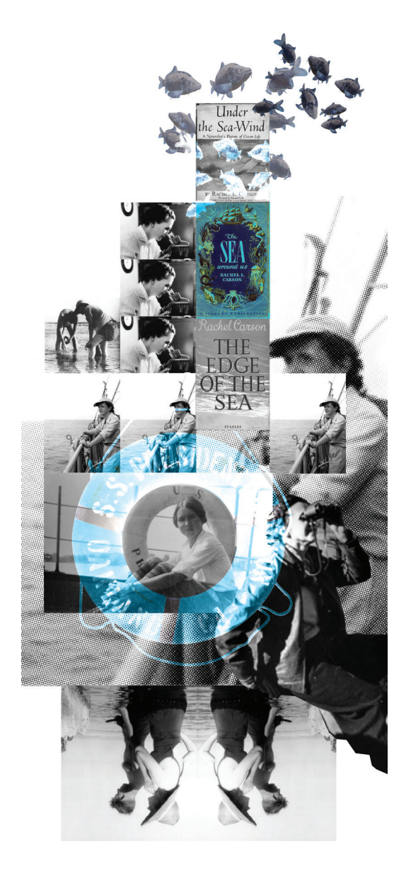
Fig. 2 Carson, Disregarded (2017). Illustration by Charity Edwards. Although undertaking decades of research and writing several best-selling science publications, Rachel Carson remains an isolated figure in the canon of scientific knowledge.

Operating from the peripheries of power, she was devalued as a 'spinster hysteric' by the scientific community even after decades of field research (see Fig. 2). Donna Haraway writes that this disregard occurs often in scientific and cultural domains, where women engage with male-dominated platforms from what is perceived either 'underneath', obliquely, or from a position as an 'amateur' – but always at a lesser level of accepted authority<sup>17</sup>.