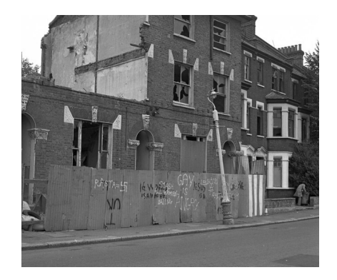
Fig. 5 St. Agnes Place 1978.