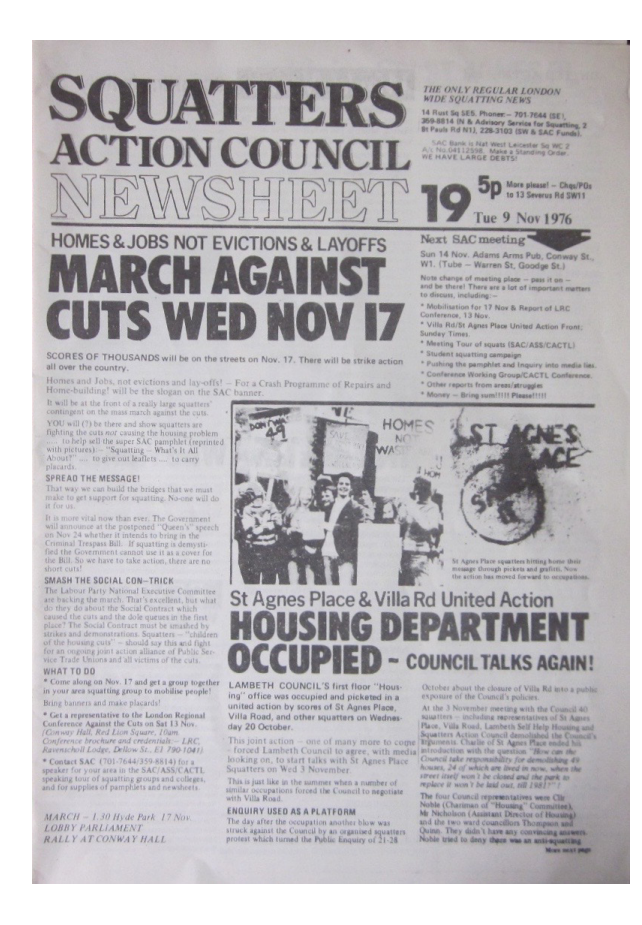
Fig.2 SAC Newsheet 9 November 1976.