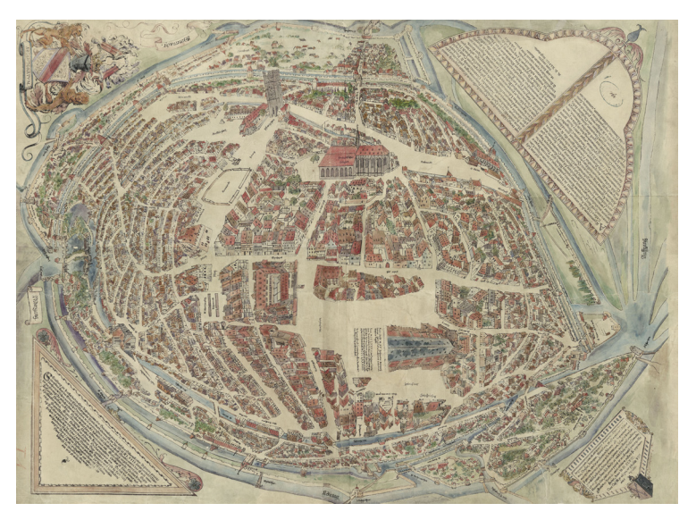
Fig. 6 Plan Morant, not dated, credit: Archives de Strasbourg, 1 Pl 1

extraordinary example of the construction of a fictional viewing point and the power of its representation. The map takes the form of a bird's-eye view, but the concentric arrangement of the buildings reveals that the map is viewed from above the white space at its center: