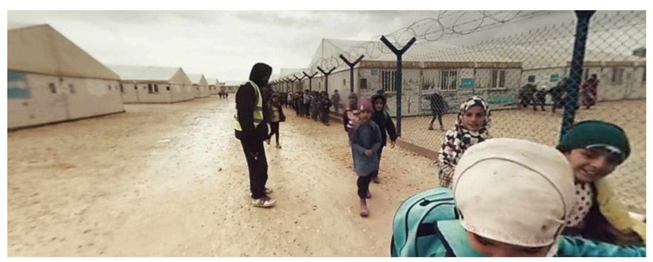
Fig. 3 Going to school, still from Clouds Over Sidra, Gabo Arora and Barry Pousman (dir.), 2015