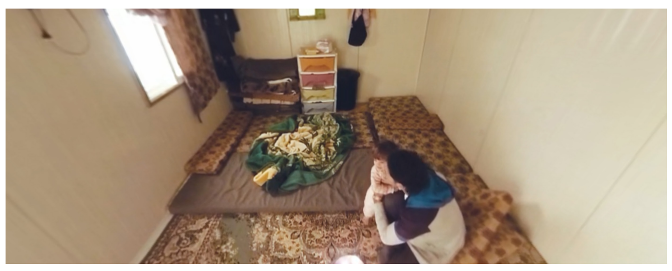
Fig. 2 Sidra's accommodation, still from Clouds Over Sidra, Gabo Arora and Barry Pousman (dir.), 2015