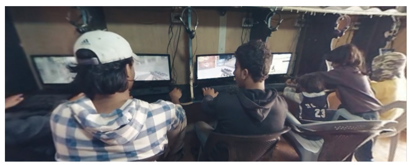
Fig. 4 The boys playing video games, still from Clouds Over Sidra, Gabo Arora and Barry Pousman (dir.), 2015