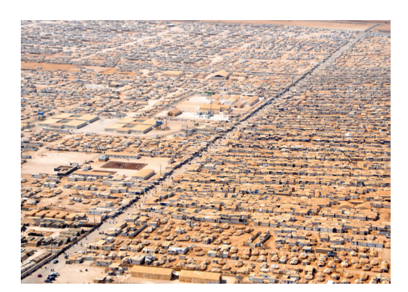
Fig. 1 A close-up view of the Zaatari camp in Jordan for Syrian refugees as seen on July 18, 2013, from a helicopter carrying U.S. Secretary of State John Kerry and Jordanian Foreign Minister Nasser Judeh.

The Zaatari Refugee Camp, Jordan, is one of the largest temporary settlements for refugees in the world, counting at the moment of writing 79,900 Syrian refugees. Set up in July 2012, the camp is comparable in size to some of the largest cities in Jordan and is run jointly by the Jordanian government and UNHCR, comprising twelve different districts, schools and hospitals and an extensive market. Numerous documentaries focusing on the life of the refugees have been filmed on the site (we will look closely at one in the following section), and the camp has become very popular in the news media, with politicians and diplomats, celebrities and journalists visiting and reporting from it. The camp is primarily represented in articles and film using views from above: high-resolution aerial photographs, bird's-eye views and even satellite photographs