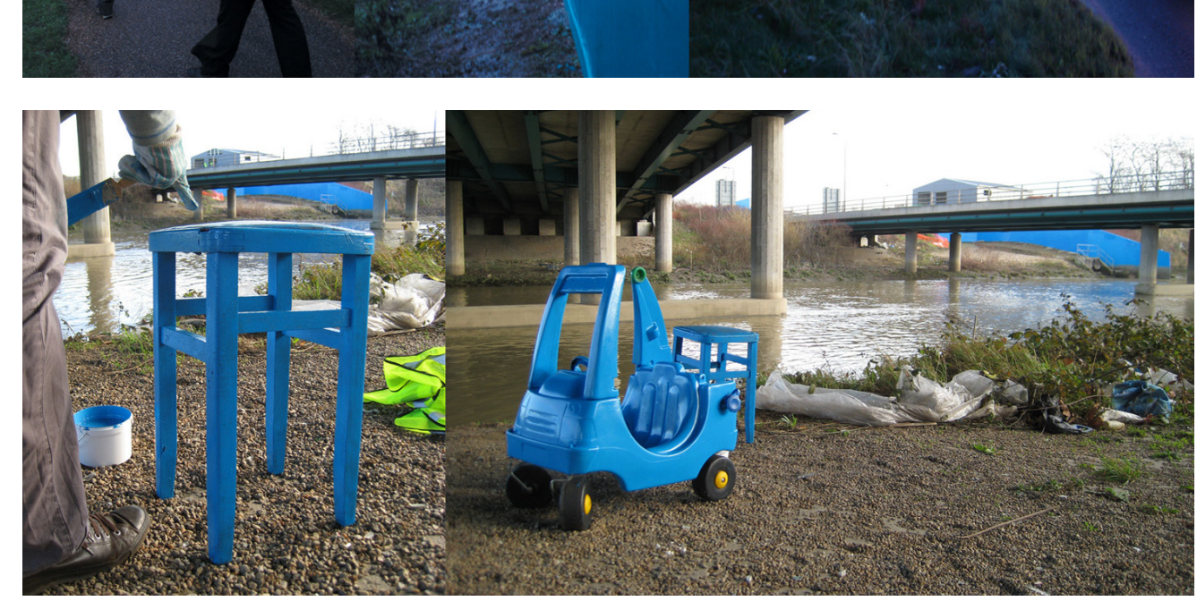
Fig. 6. 'Olympic Perimeter Walk', London, January 2008.

Fig. 7. 'All Aboard', London.