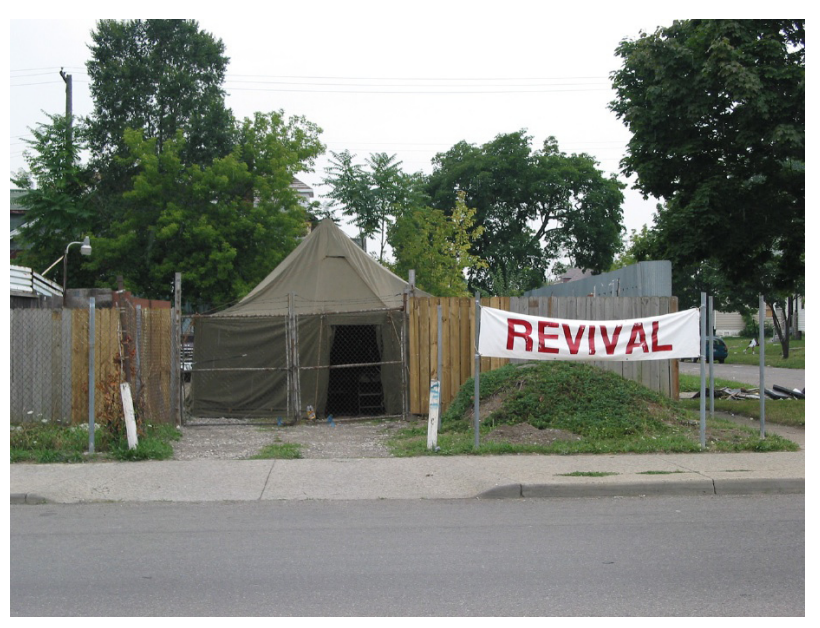
Fig. 1. ' Détroit ville résiliente (Detroit Resilient City)'.

Adaptive Actions operate a shift in focus from representation and aesthetics to the programming of possibilities of use in the built environment. By observing, revealing and sharing residents' adaptive actions, this project aims at encouraging others to act and engage with their environment as well as informing designers on possible extensions to their programme.