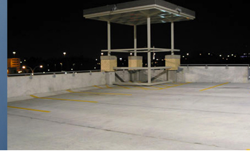
Fig. 11. 'Residual Spaces'.

constantly rethought through all these cycles rather then simply built and demolished. All buildings are initially biased and comply to a specific programme. Buildings should be constantly observed, monitored, rethought, and reworked. Residents, upon intuition and observation, may suggest actions, which, with more means and further discussion, could be progressively materialised.