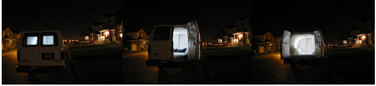
Fig. 8. 'P L A: Public Loitering Area'. Fig. 9. 'Use Inflexions'.