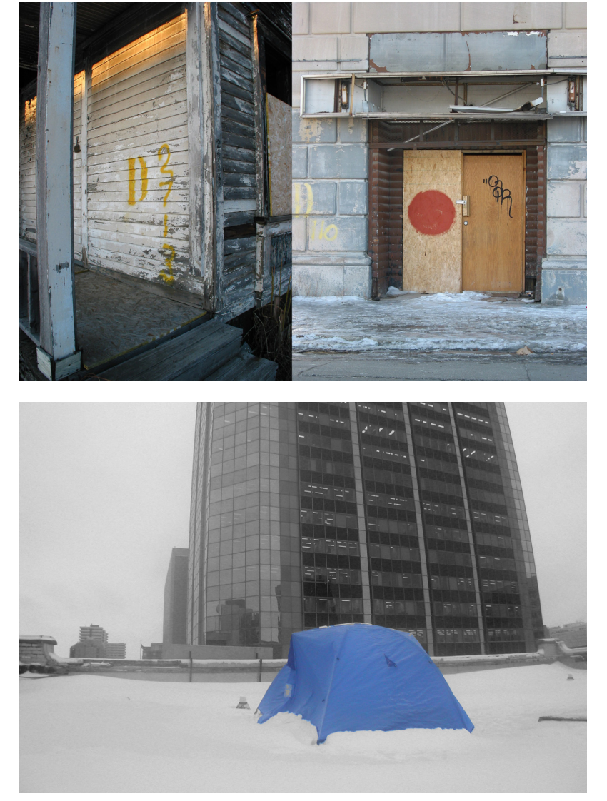
Fig. 12. Pessac by Le Corbusier.

Fig. 13. 'Dots versus Demolition D'.