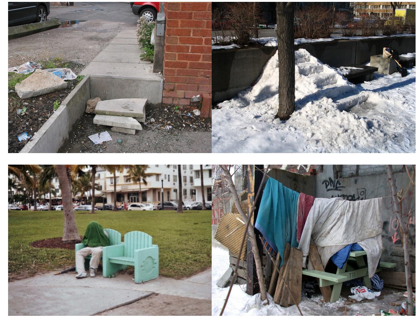
Fig. 2. 'Passage'. Fig. 3. 'Passage 03'.

In order to document and create an inventory of existing urban alterations, an ongoing survey or call for collaboration, open to all, is announced on the Web and through printed documents. It should be noted, however, that since these realities take place on a small scale, and are often only known to a restricted number of locals, the request for postings is used to accelerate the process. Collaborators register and log in as actors on the website and submit actions directly and instantly on-line, add links, text or comments if desired. By offering a space to share experiences, ideas,