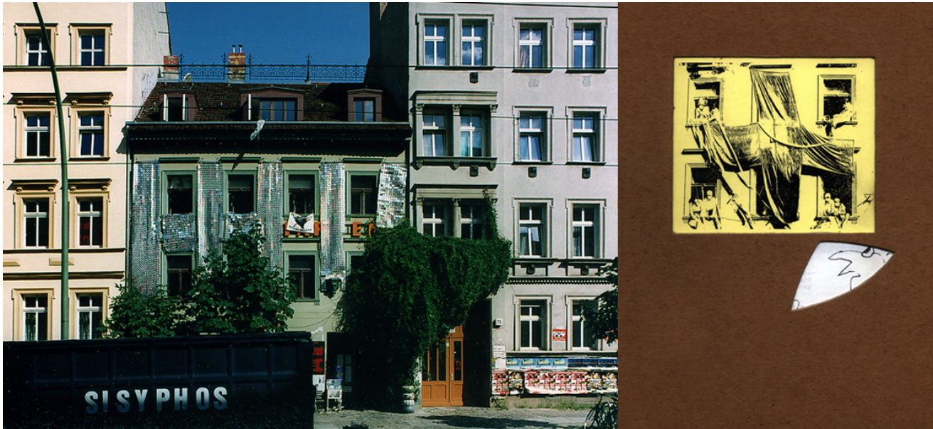
Fig. 3. (Left) Kunst. Kommune. Kapital. 10 Jahre K 77 (Art. Commune. Capital. 10 Years K 77). Image: Mathias Heyden, Berlin 1992. Fig. 4. Cover: Stilkamm 5 1/2 e.V und die Vereinigten Varben Wawavox stellen vor: Ihre Geschichte und ihr Konzept für ein Haus zum gemeinsamen Wohnen und Arbeiten (Stilkamm 5 1/2 e.V and the Vereinigten Varben Wawavox present: Their History and Concept for a House of Common Dwelling and Work) . Design: Mathias Heyden, Berlin 1992.

(inner) neighbourhood, so that the usage and interpretation of available spaces is constantly renewed.