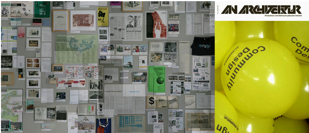
Fig. 9. An Architektur 19: Community Design. Involvement and Architecture in the US since 1963 , exhibition by An Architektur and Mathias Heyden. Photo: Ines Schaber, Berlin 2008. Fig. 10. Cover (forthcoming): An Architektur 19 , An Architektur and Mathias Heyden. Design: Till Sperrle.

the marginalised and can thus can work critically and productively against domination and segregation in US-urbanism and perhaps even abroad. A careful examination of such strategies seems valuable, at least in order to reconsider the particularities of self-determined and participatory planning and building in (central) Europe. Community Design. Involvement and Architecture in the US since 1963 , a recent Berlin cooperation with the magazine AN ARCHITEKTUR. Produktion und Gebrauch gebauter Umwelt , produced an exhibition and talks with community design actors. 22