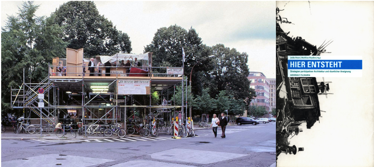
Fig. 5. Hier entsteht. Strategien partizipativer Architektur und räumlicher Aneignung. Bauexperiment, Ausstellung, Vortragsreihe und offener Raum für Spontanansiedlung und ungeplante Aktivitäten (Under Construction. Strategies of Participative Architecture and Spatial Appropriation. Exhibition, Lecture Series and Open Space for Spontaneous Settlements and Unpredictable Activities) , Jesko Fezer and Mathias Heyden, and Students of the University of Arts Berlin, Department of Architecture. Photo: Mathias Heyden, Berlin 2003. Fig. 6. Cover: Jesko Fezer und Mathias Heyden (Hg.), metroZones 3, Hier entsteht. Strategien partizipativer Architektur und räumlicher Aneignung, (Under Construction. Strategies of Participative Architecture and Spatial Appropriation) , Design: bildwechsel / www.image-shift.net, Berlin 2004 / 2007.

to historical discourses and projects starting from the 1960s and extending to present-day concepts and experiments. The publication works as a scientific reader as well as an easily accessible and useful handbook. It includes an introduction, various edited interviews with biographical notes, project illustrations, and correlated material such as additional texts and images, a guide on participative architecture in Western Europe (1960-1990), and an index of people, projects and material documenting the Berlin event Hier entsteht in June/July 2003. The main part of the book, the edited interviews held in 2003/2004, features theories, investigations, tactics and practices on communication, design, planning and building ranging from self-building to CAD; on architectural education as well as on self-empowerment, common property and community building. 8