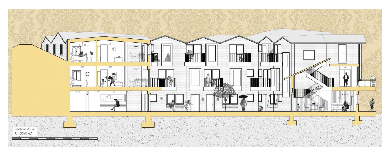
Figure 2. Detailed Section drawing, inhabited by an ethnically specific group of housing dwellers and users, by Anu Shemar, 2020.

of the spatial story of any student project. The Image Equality Archive acts as the link between these diverse spatial stories and the ongoing work of collective imagination for equality in representation of the user and habitation in architecture. Yet the archive has its risks and vulnerabilities. Representing diversity without understanding the context of minor intersections risks replicating established structures and stereotypical forms of representation. The archive supports open conversations around intersectionality and makes visible the minefield that resides within our imaginaries that will remain invisible if the subject of representation is left untouched. We also understand that figures inserted into the archive are tools for uncomfortable conversations. However, an image in itself will not be enough to initiate conversations. Because this is an ongoing process, the archive needs an institution or a body that can take care of the space of conversation, maintaining its safety and openness. The form of conversation should go beyond the human figure and clearly frame its relations with intersectional discourse through reflective practices on habitation and use.