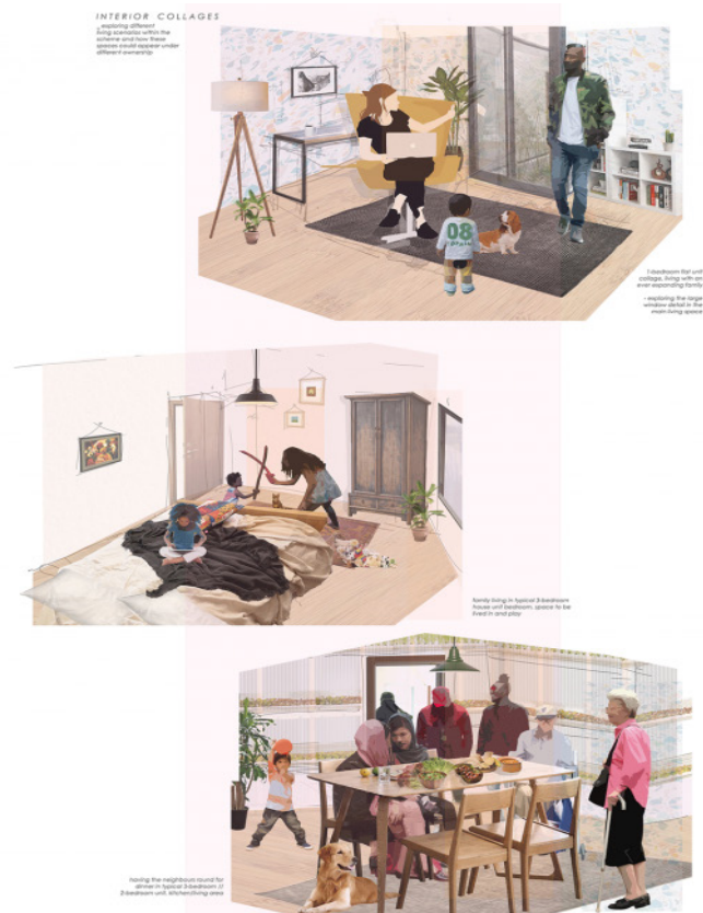
Figure 3. Perspective images and plan details, inhabited by a diverse range of family groupings, by Jasmine Yeo, 2020).